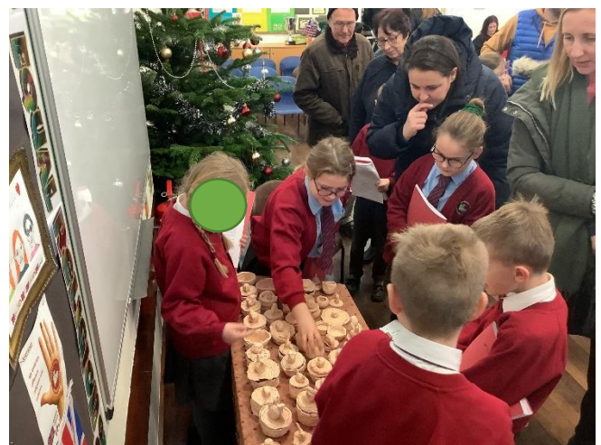
School Worships and Church Services